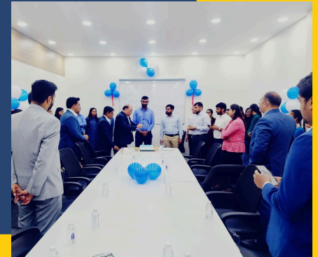
Celebrating Promotions in Positions cheers to growing with the hive!