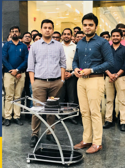
Buzzing with birthday cheer and cake.