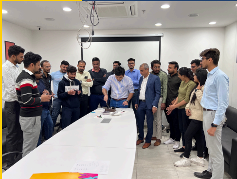
Performance Appraisals Celebrating growth, goals, and good vibes